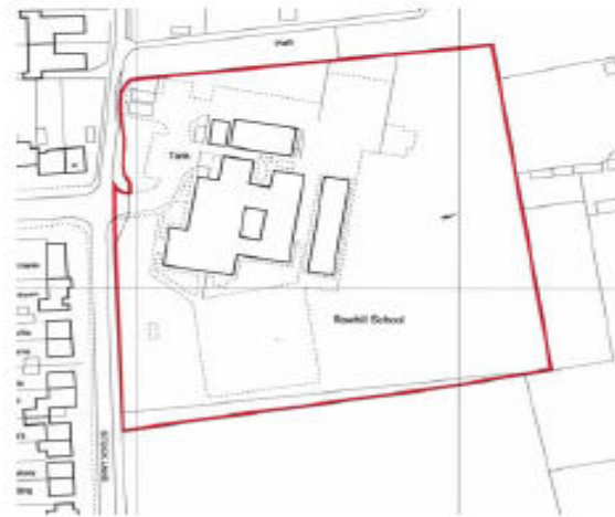
Site Plan of Rowhill